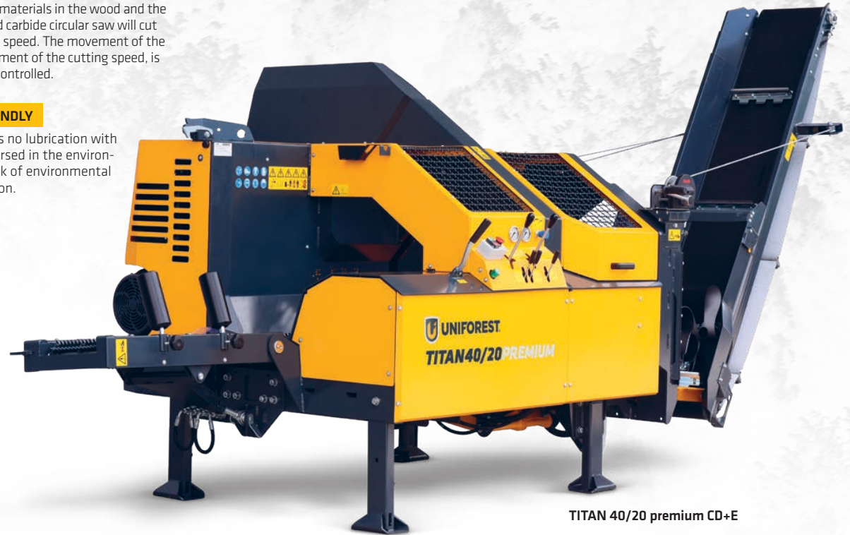
TITAN 40/20 premium CD+E

In addition to easy maintenance, these features enable the machine to be used under harsh conditions.