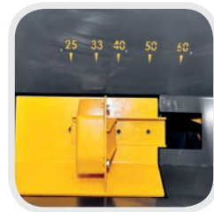
Splitting length 25, 33, 40, 50 or 60 cm.