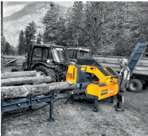
TITAN 40/20premium with LOG DECK