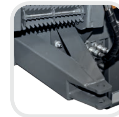
Towing hitch for linkage tool bar (draw bar - optional).